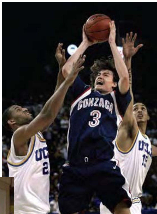
Adam Morrison gets one past UCLA.

A No. 3 seed into the tournament, the Zags whipped No. 14-seed Xavier 79-75 on March 16 and defeated the No. 6 seed Indiana Hoosiers 90-80 two days later, before falling to UCLA 73-71 at the Oakland Arena on March 23 in a heartbreaking ending to a wonderful season. In April, Morrison announced he would forego his senior year at Gonzaga and declared himself eligible for the upcoming NBA draft.