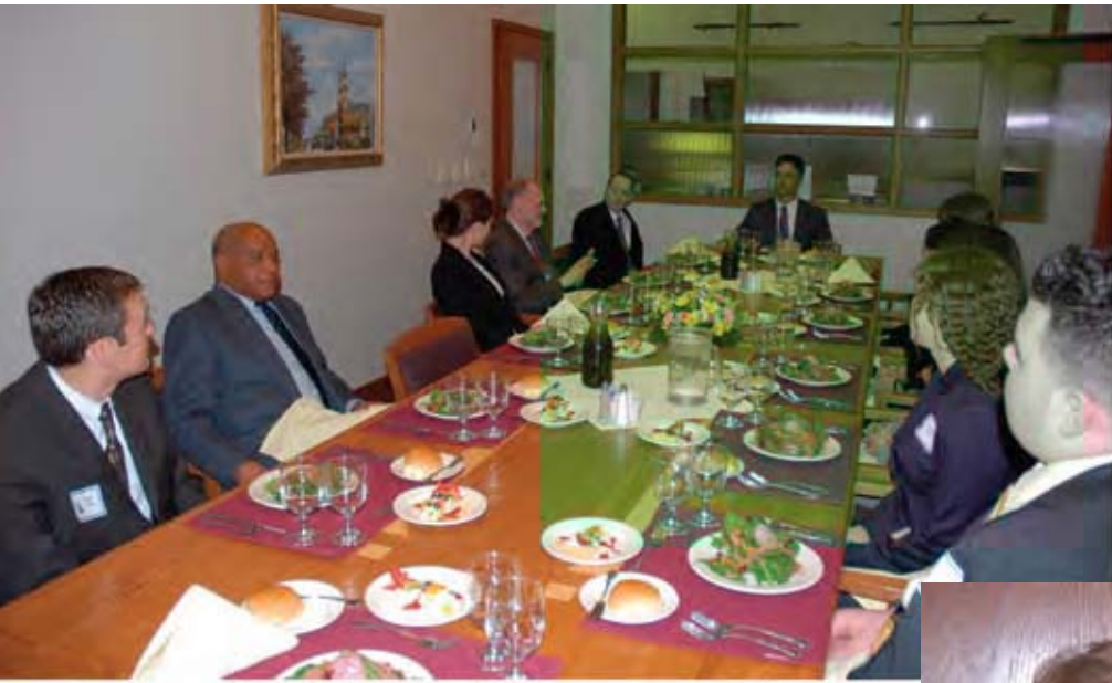
9th Circuit Court Lunch

The hearings were held in the Barbieri Courtroom, to a capacity audience. Following the hearings, students had the opportunity to